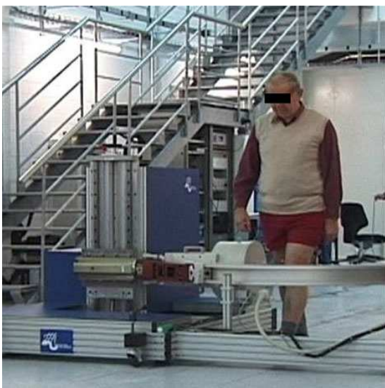
Figure 2. Unit mover with C-arm during an experiment.

The video-fluoroscope X-ray images were taken with 25 Hz with a shutter time of 8 ms. The tube measures 12" in diameter.